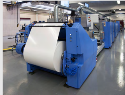
Pulp and Paper